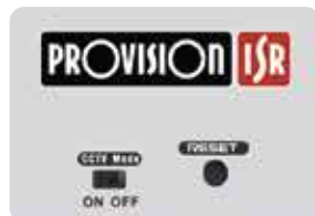
CCTV Mode + Reset Switch