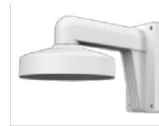
LX-1273ZJ-135 Wall Mount