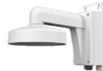
LX-1273ZJ-135B Wall Mount